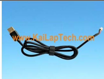
Rallonge de câble USB. Vendu séparément.

www.KaiLapTech.com sales@KaiLapTech.com Tel: (852) 6908 1256 Fax: (852) 3017 6778